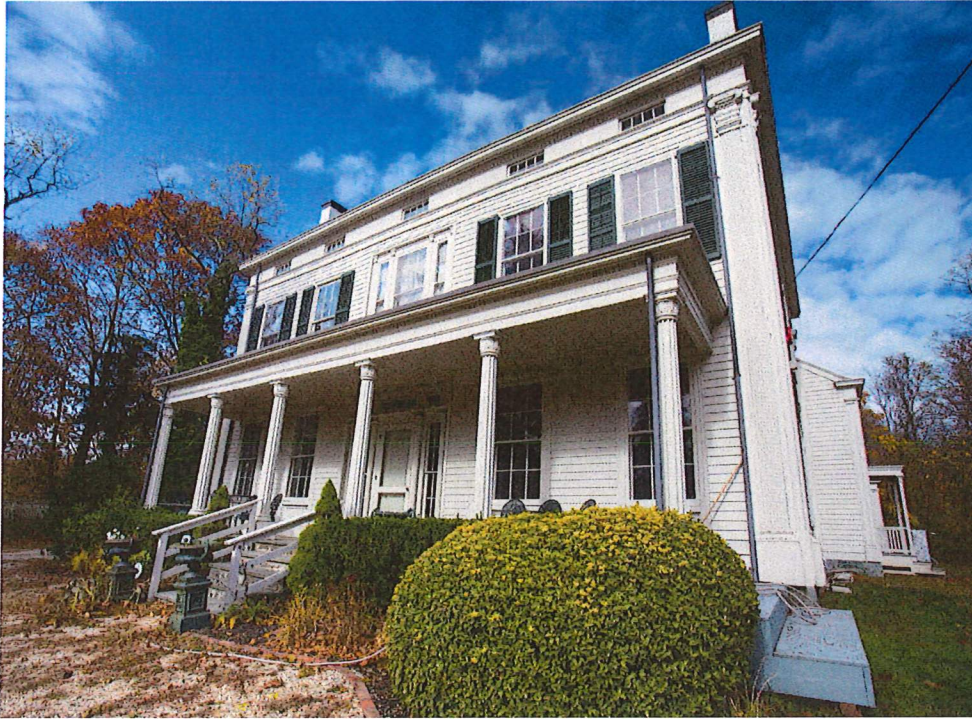
! The old Barnaby Estate